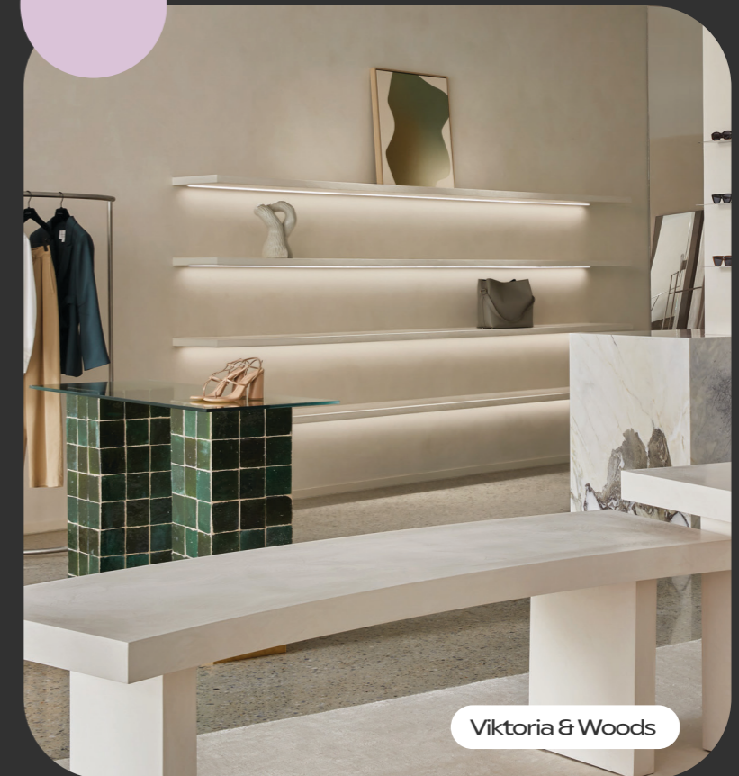
Viktoria & Woods