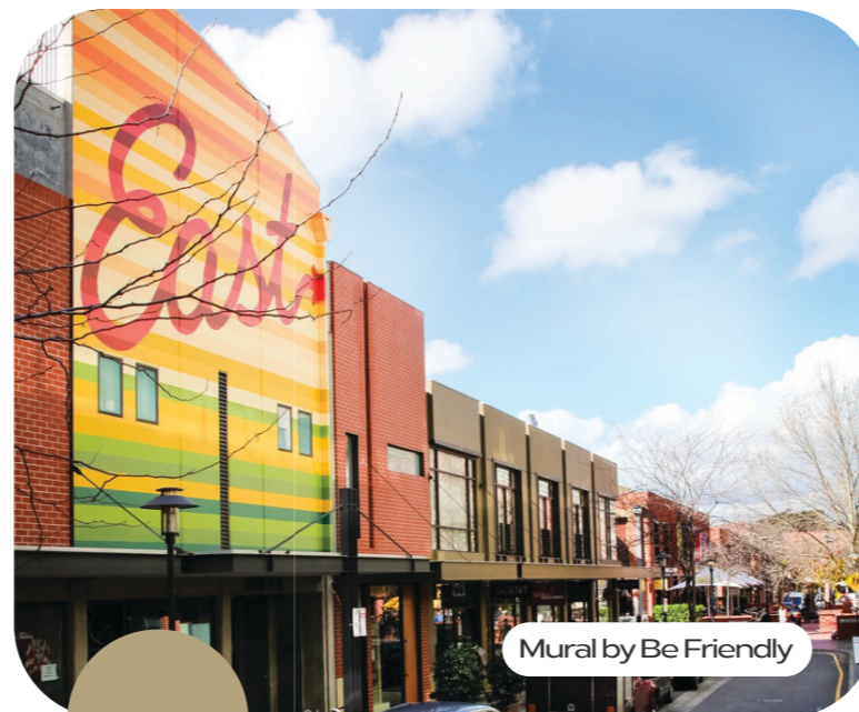
Mural by Be Friendly