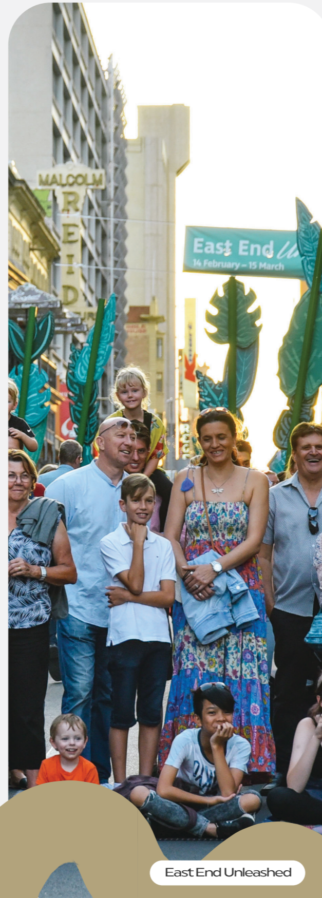
East End Unleashed

Maras Group considers its tenants as “partners” and always seeks to assist them wherever and whenever possible. As a tenant of Maras Group, you will enjoy the following benefits: